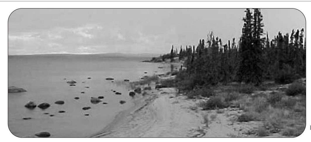
LEFT: WEKWETI SHORELINE

Government agencies at the community, territorial, and federal levels have an important role to play in ensuring the quality of drinking water in the Northwest Territories (NWT). Managing Drinking Water Quality in the Northwest Territories outlines a safe drinking water framework and strategy for the NWT, based on a review of other Canadian jurisdictions and the specific needs of the NWT. Together the framework and strategy provide a preventative system to safeguard NWT drinking water, and ultimately contribute to the health of Northwest Territories residents.