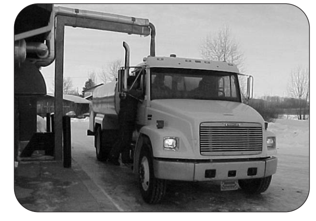
ABOVE: FORT LIARD FILLING STATION

While all stakeholders have important roles to play in ensuring the quality of NWT drinking water, this document focuses specifically on government agencies at the community, territorial, and federal levels, unless otherwise stated. Stakeholders were consulted in the development of the framework and strategy in the summer and fall of 2003.