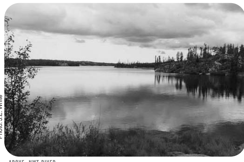
AROVE. NWT RIVER

The framework and strategy outlined in this document will be used to guide planning and decision-making for the management of drinking water quality over the coming years. Implementation requirements such as outcomes, performance indicators, data needs and associated costs are being developed by the GNWT. As the operating environment changes and improvements to best practices emerge, the framework and strategy will be adjusted to ensure continued safe drinking water management in the NWT.