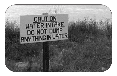
ABOVE: NWT LAKE MIDDLE: TUKTOYAKTUK SOURCE WATER TESTING BELOW: FORT PROVIDENCE INTAKE TO MACKENZIE RIVER