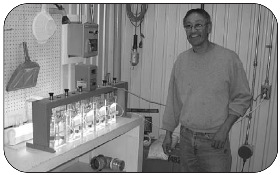
ABOVE: FORT PROVIDENCE TEST STATION