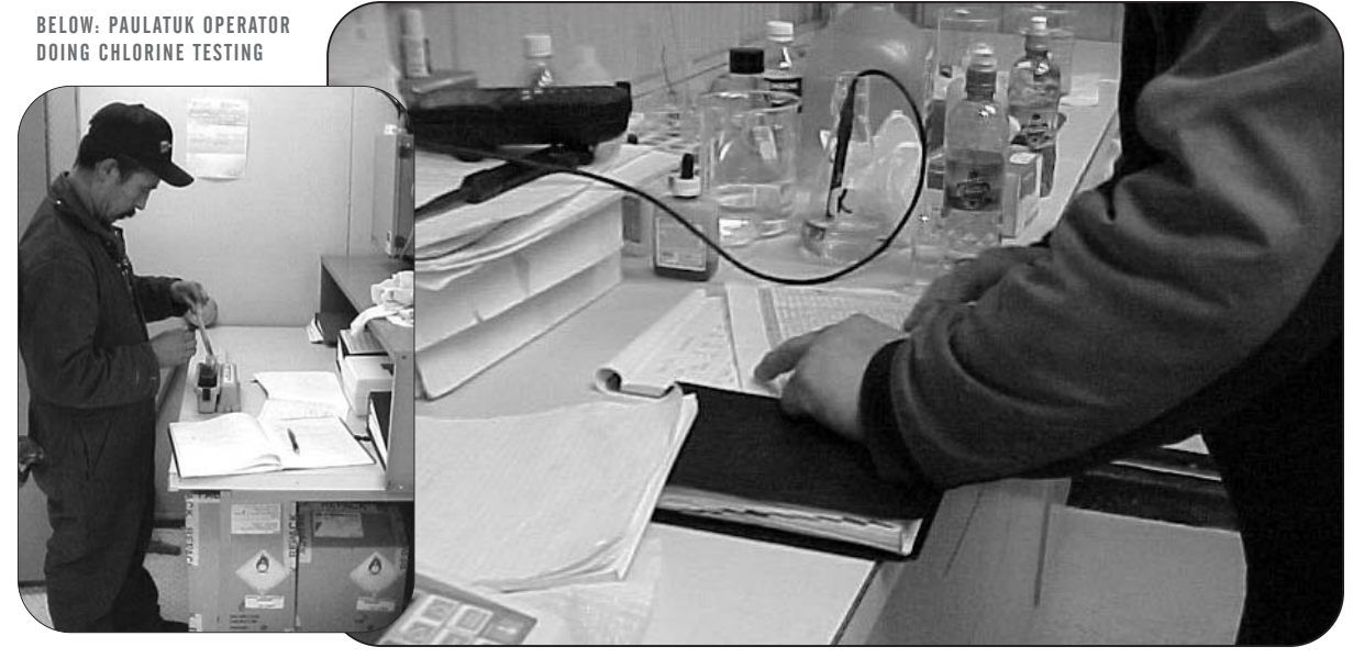
ABOVE: FORT MCPHERSON MONITORING

Public Education – Informing the public about what testing is being done, the testing results, and who is responsible, helps assure them that their water supply is safe and reliable, and allows them to take action when they sense a problem.